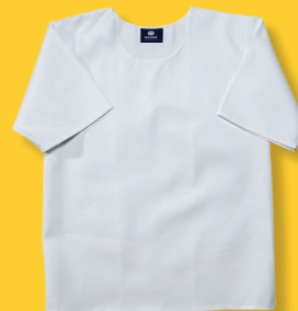
S/S COTTON ROUND NECK