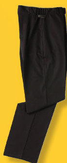
POLYCOTTON FLAT FRONT TROUSER