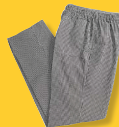
CHECK POLYCOTTON TROUSER