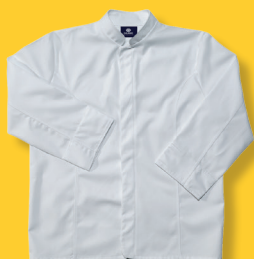
L/S POLYCOTTON WAITERS JACKET