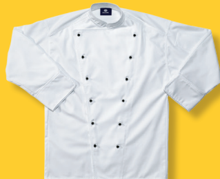
POLYCOTTON CHEFS JACKET