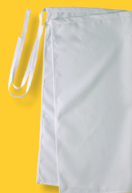
WHITE WAIST APRONS

Heavyweight polycotton or 100% polyester